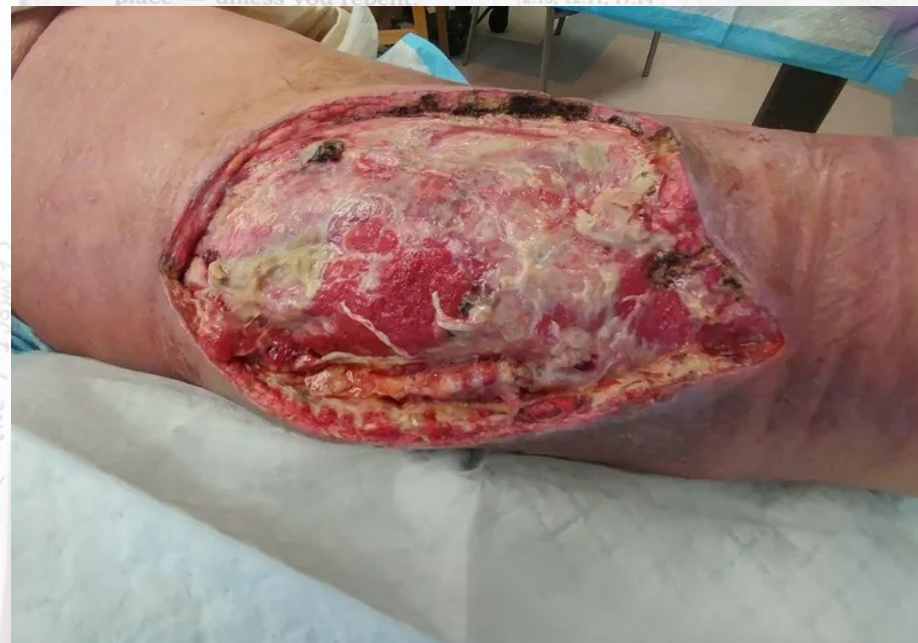
(MAY 17 1989) LUKE 9:30-35